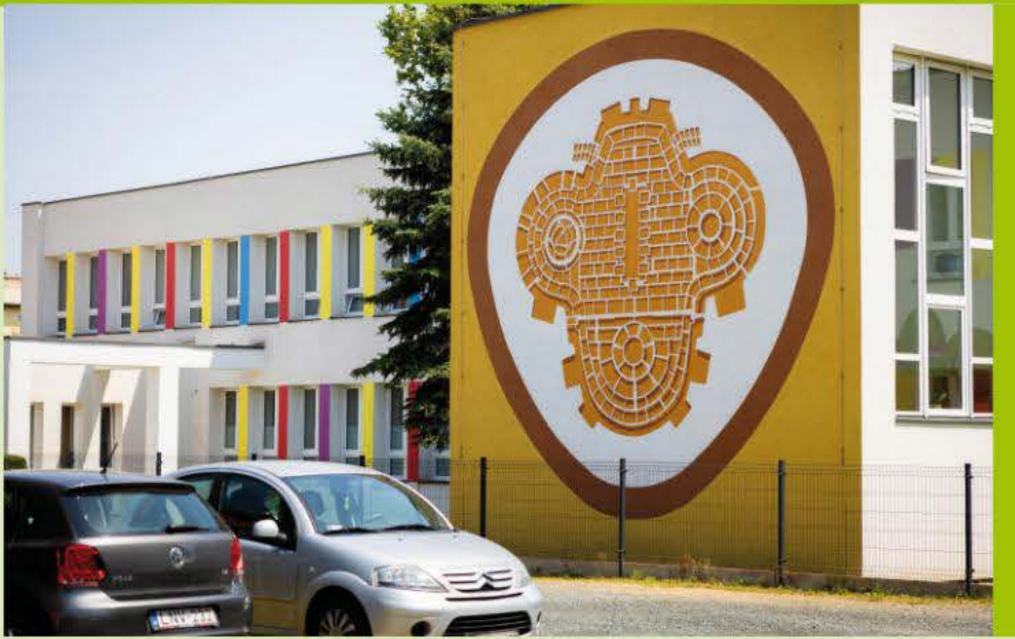
István Szántó: Télemakhosz (2021) Location: Szombathely, Aréna utca 8/a