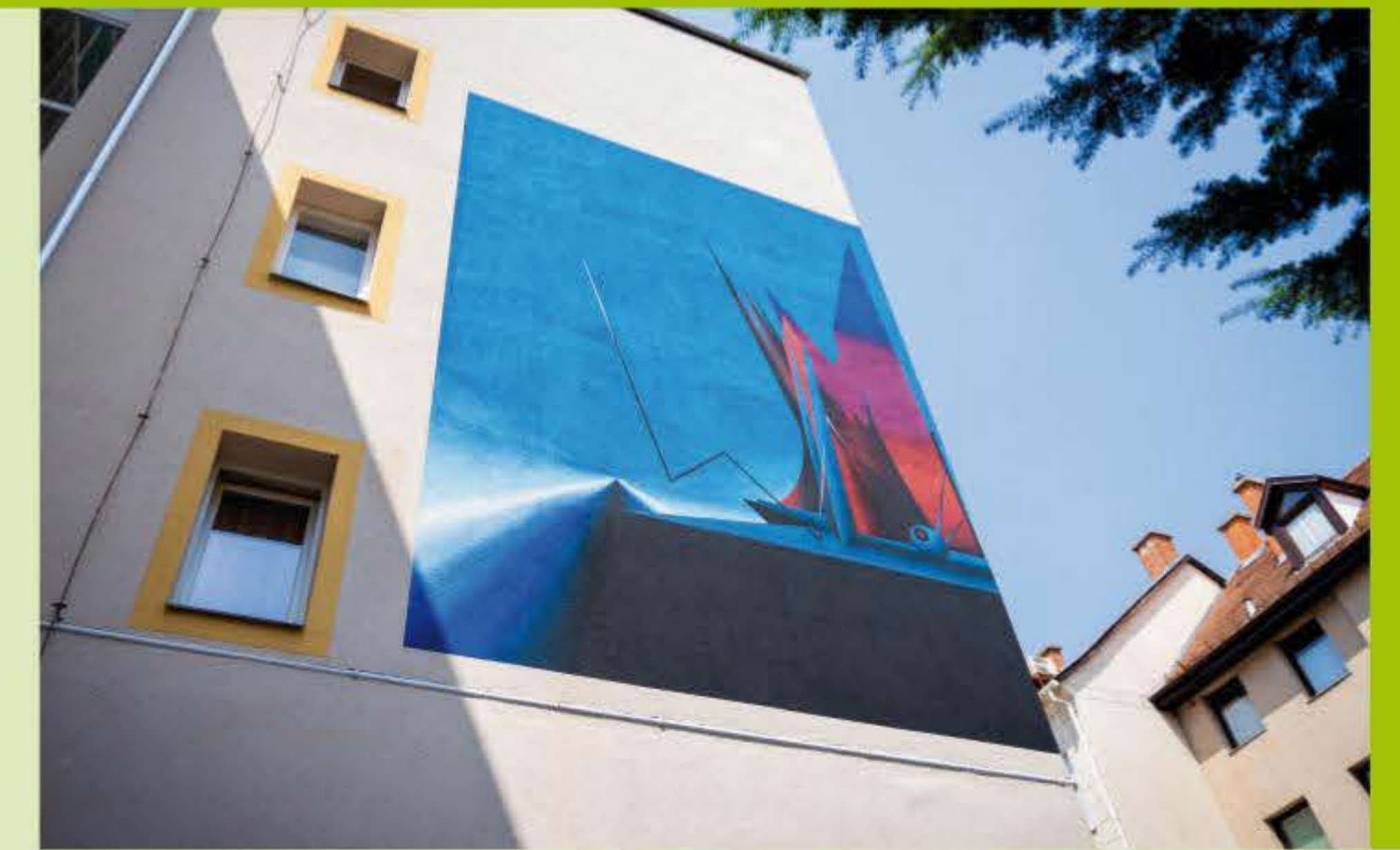
Zsolt Molnár: Border (2023) Location: Szombathely, Kőszegi utca 6.

Eszter Szabó's mural is a critical re-imagining of Ulysses in an image, a short animation and a page of text. With the help of an augmented reality application (Artivive), the viewer can watch a video with the camera on their smartphone, in which the woman (Molly Bloom) in the picture comes to life and her own rescripted inner thoughts become audible.