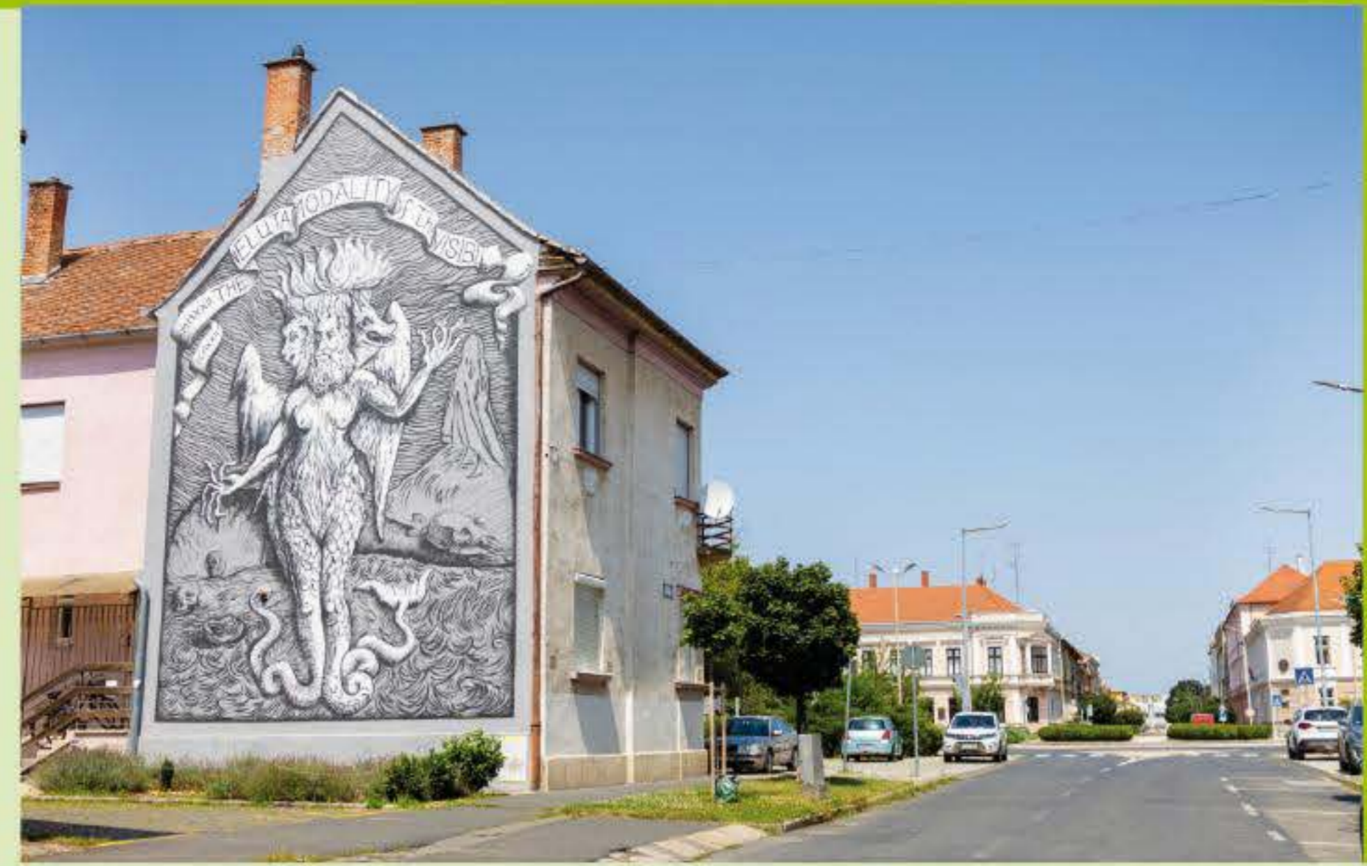
Aideen Barry: The Unwary Ways of Perception (2022) Location: Szombathely, Zrínyi Ilona utca 3-5.

"The picture depicts the chapter's location through the structural drawing of the second floor of a so-called Martello tower, a small round defensive fort. I chose an anthropomorphic drawing. With this appropriated form, everything about the first episode of the novel's first chapter can be expressed simultaneously."