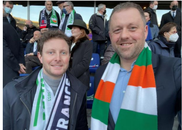
Above and Left: Policy Dialogue and Cooperation

Irish Ministers Simon Coveney and Thomas Byrne meet with their then French counterparts Jean Yves Le Drian and Clément Beaune