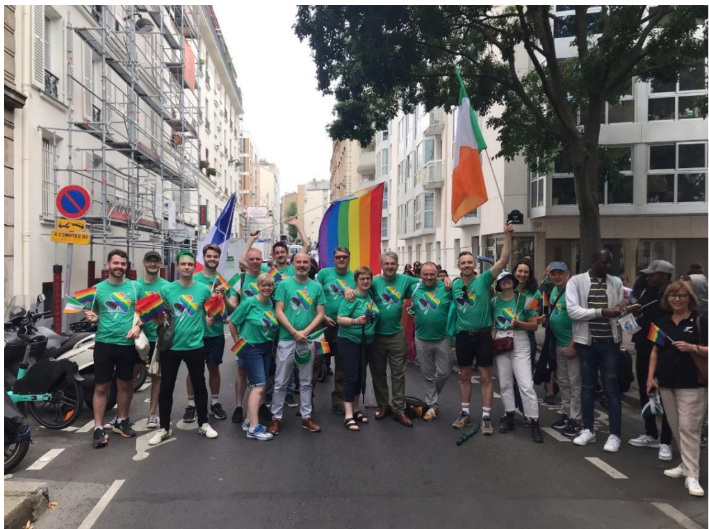
Right: People-to-People Links