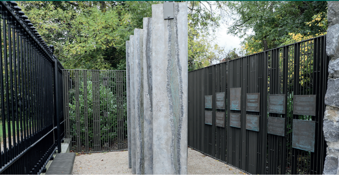
Human Rights Defenders Memorial, Iveagh Gardens, Dublin